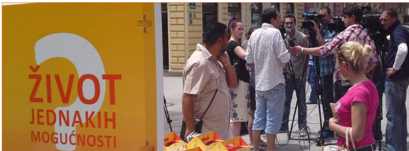
Promotional “street campaign” “Pillar of Shame”, Sarajevo

The biggest result achieved by this campaign is not more than 200 media appearances. The biggest results is that messages and stories of these “invisible” got their place in the media space, and the Roma population left its place in the “forgotten” category. The problems with which the Roma women and men are living with should be sufficient incentive to have these topics always present in the media reporting. This is the only way for the Roma population to have more changes for a life of equal possibilities.