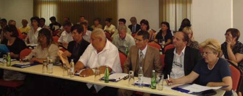
Operational Team meetings - Roma representatives and representatives of regional governmental institutions

(e.g. participation of municipalities with the support of the Roma non-governmental organization in the housing projects, which are being realized by the BiH Ministry for human rights and refugees), but also the opportunity to initiate dialogue and cooperation. This dialogue either did not exist before or it was very rare.