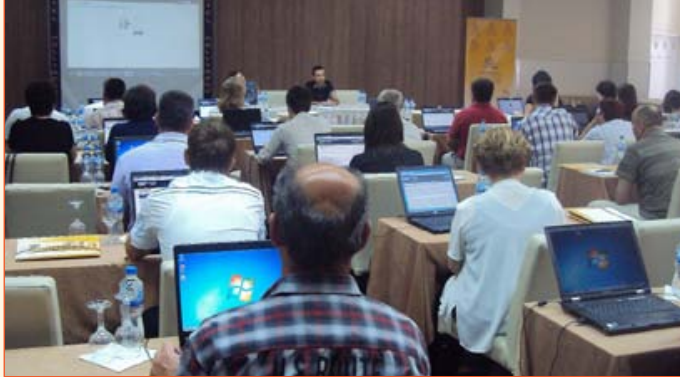
Educational workshops for centers for Social work