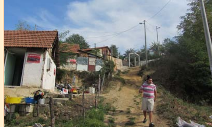
Setting up street lighting in Roma settlement Mušinac-Tuzla