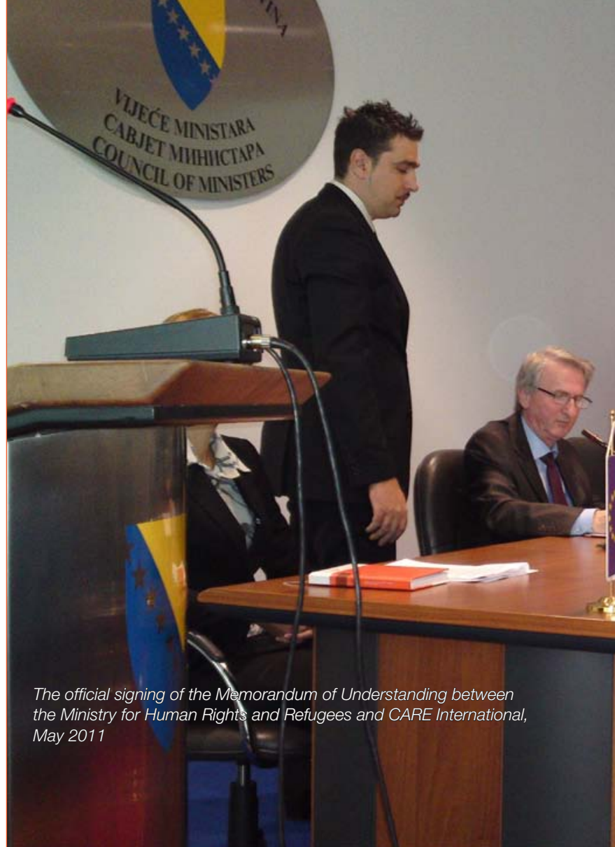
The official signing of the Memorandum of Understanding between the Ministry for Human Rights and Refugees and CARE International, May 2011