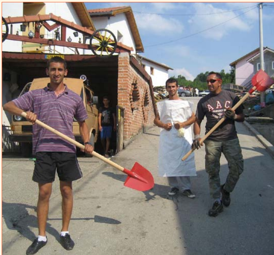
Roma activists in action of cleaning the Roma settlement in the municipality Zavidovići

The aim of the project was cleaning and arranging Roma settlements Rupin Dol, Dragova and Dolovi on the territory of Zavidovići municipality, a raising awareness of the Roma people about the living culture through holding ecological workshops. Partners: 70 volunteers for the community and Public communal enterprise "Radnik" Zavidovići. The total value of the project is 5.835,00 KM, whereof the CARE International donated 4890,00 KM.