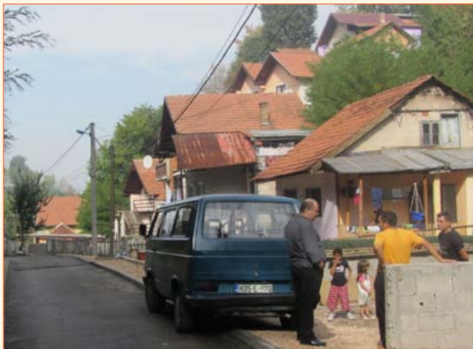
The reconstruction of the roads in Roma settlement Red Njive - Tuzla

of this story are they. They are the ones who recognize the most important needs of their Roma population, transfused them into a project and at the end put additional efforts to realize the projects. In most of the cases the leaders of these organizations invested their time and actually voluntarily realized the project – as one of our colleagues said – just to leave more money for concrete work. Here is what they said about the projects they implemented: