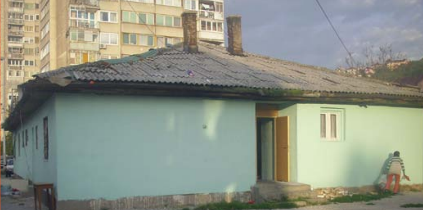
Settlement for about 20 Roma families Reconstructed in Sarajevo

The project was intended to reconstruct a Roma settlement in Sarajevo canton, landscaping and reconstruction of existing facilities. The project was realized aimed at improving living conditions for more than 20 Roma families. Additional value of the project was networking of Sarajevo Roma organizations (6 organizations) that initiated establishment of a Roma network and a culture center in the future. The total value of the project is 4890,00 KM and it was completely financed by the CARE international.