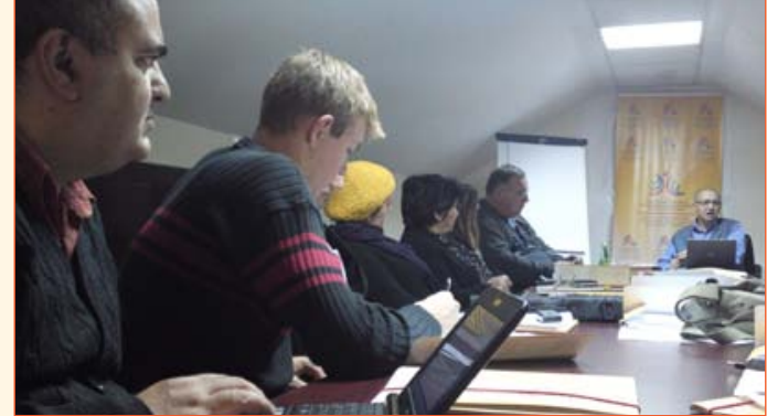
Educational workshops for representatives of the Roma

We organized two types of workshops for representatives of Centers for social work. First workshop was on use of software to record the needs of Roma population for the Data base that is being developed, and second one about cooperation of local institutions, centers for social work and non-governmental organizations and preparation of a project for solving the Roma problems at the local level. These workshops were attended by more than 200 participants. We are delighted by the fact that the participants' experience had showed that this was the right move, since not only they acquired new knowledge together, but for the first time they had opportunity to talk on various aspects of the cooperation and establish much needed dialogue.