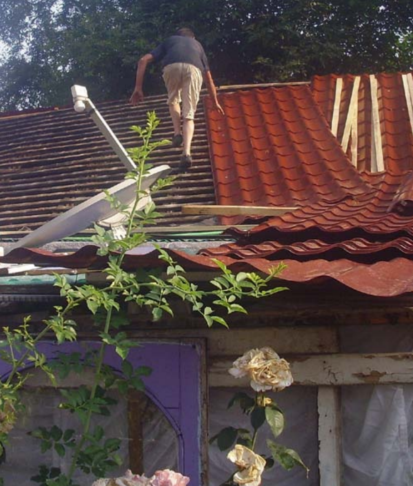
The residential building was reconstructed for 6 Roma families in Roma settlement of Sarajevo