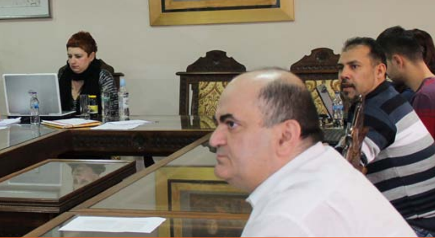
Educational workshops for Roma coordinators

We organized two types of workshops for representatives of Centers for social work. First workshop was on use of software to record the needs of Roma population for the Data base that is being developed, and second one about cooperation of local institutions, centers for social work and non-governmental organizations and preparation of a project for solving the Roma problems at the local level. These workshops were attended by more than 200 participants. We are delighted by the fact that the participants' experience had showed that this was the right move, since not only they acquired new knowledge together, but for the first time they had opportunity to talk on various aspects of the cooperation and establish much needed dialogue.