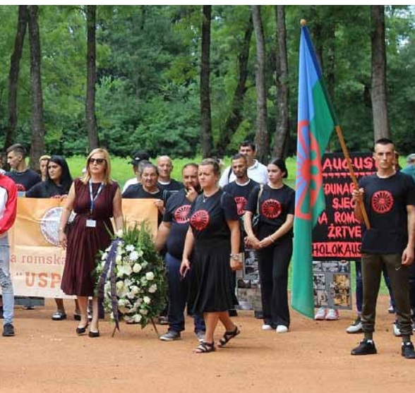
International Roma Genocide Remembrance Day (August 2, 2021)