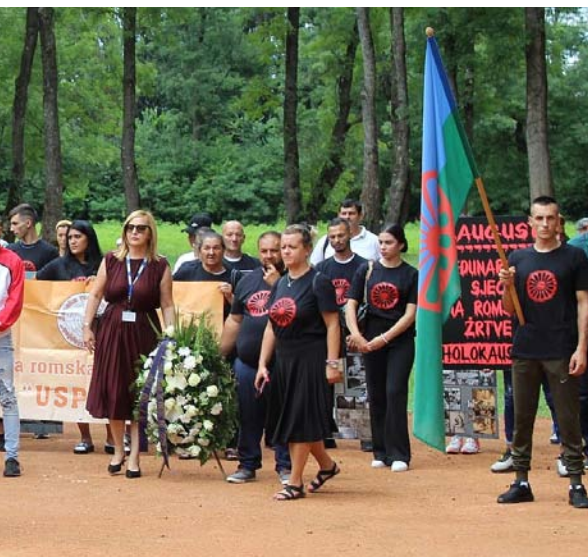
International Roma Genocide Remembrance Day (August 2, 2021)